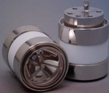
Xenon Collimated Parabolic Reflector - B body Size